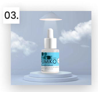
Fumiko COLLAGEN SERUM