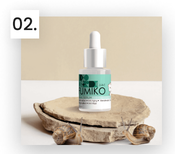
Fumiko SNAIL SERUM