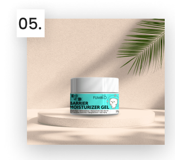
Fumiko MOISTURIZER GEL