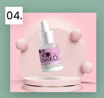
Fumiko ALMING SERUM