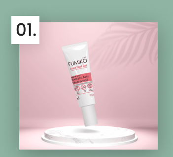
Fumiko ACNE SPOT GEL